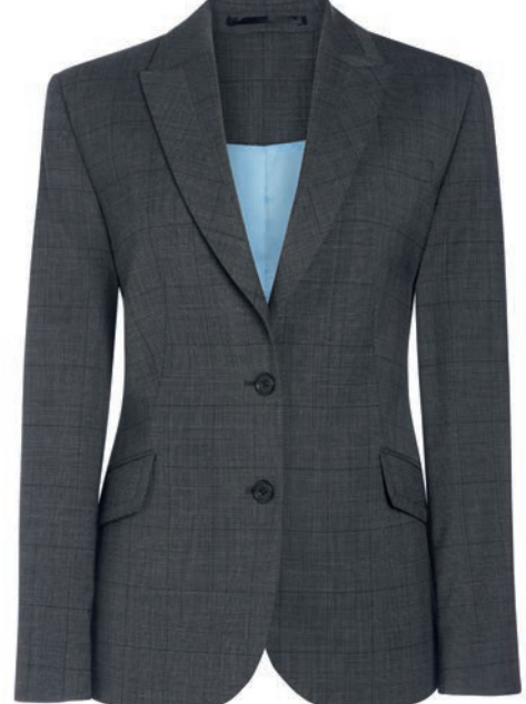
NOVARA TAILORED FIT JACKET 2330 A,C

Sizes: 6 - 16 short 6 - 24 regular 8 - 18 long