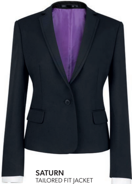
SATURN TAILORED FIT JACKET 2255 A,D

Sizes: 8 - 16 short 4 - 26 regular 10 - 18 long