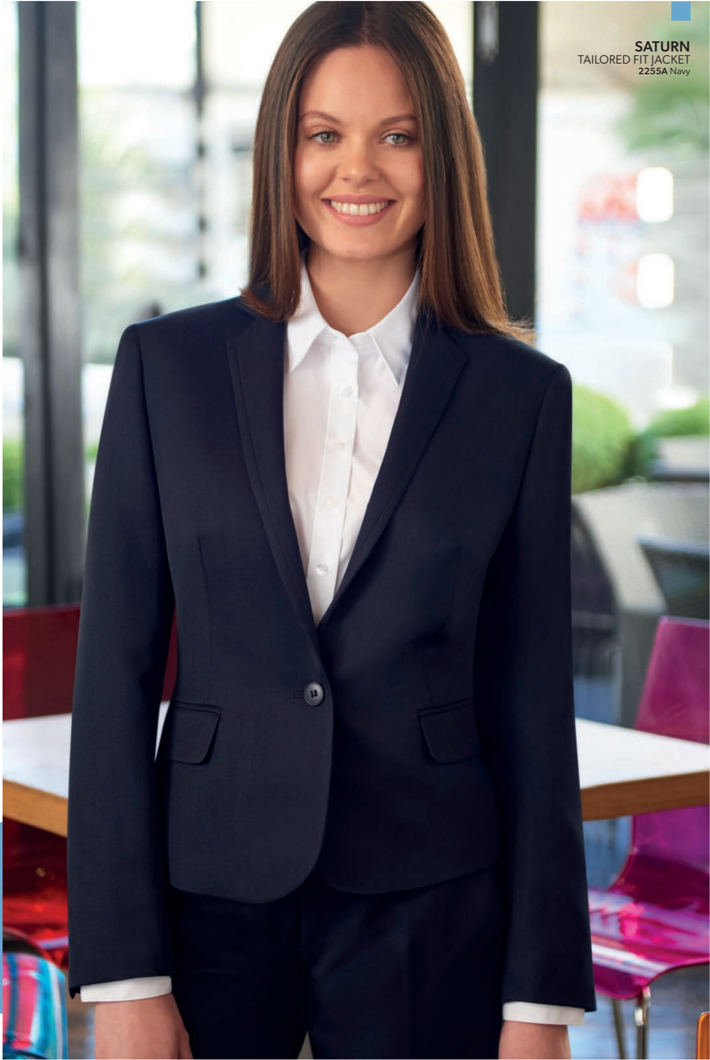
SATURN TAILORED FIT JACKET 2255A Navy