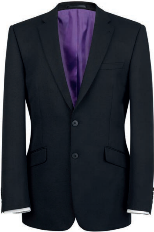
JUPITER TAILORED FIT JACKET 3344 A,D Sizes: 38" - 44" short 34" - 50" regular 40" - 46" long Centre back length at size 40R = 76cm