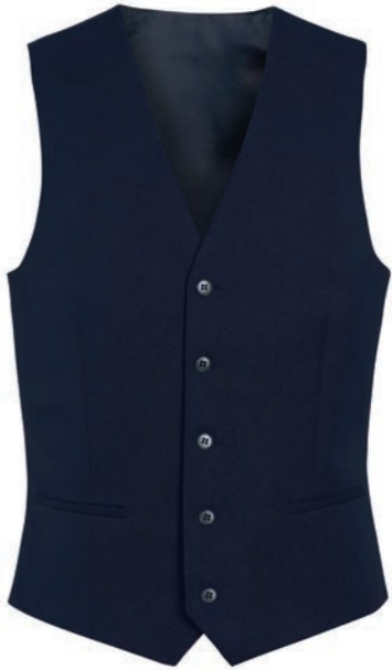
MERCURY WAISTCOAT 1295 A,D Sizes: XS 34" - 36" S 38" - 40" M 42" - 44" L 46" - 48" XL 50" - 52" Centre back length at size M = 63cm