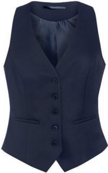
LUNA WAISTCOAT 2257 A,D

Sizes: XS 4 - 6 S 8 - 10 M 12 - 14 L 16 - 18 XL 20 - 22 XXL 24 - 26